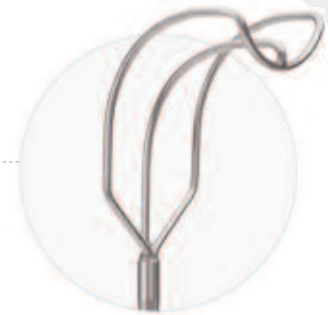
Atrial Rake Large