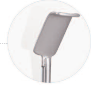
Aortic Valve Assistant Large