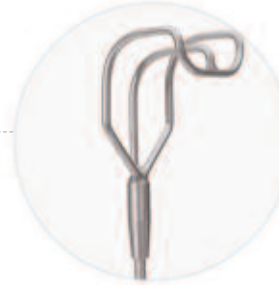
Atrial Rake Medium