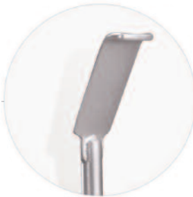
Aortic Valve Assistant Small

ESTECH'S Aortic Valve Assistants coupled with the Universal Stabilizer platform provide optimal surgical exposure for aortic valve procedures (also useful for mitral valve exposure when using a transeptal approach).