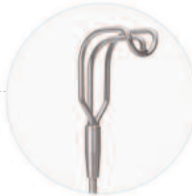
Atrial Rake Small

ESTECH'S Atrial Rakes coupled with the Universal Stabilizer platform provide optimal surgical exposure for mitral valve procedures.