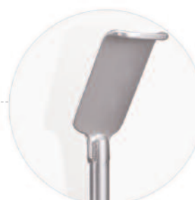
Aortic Valve Assistant Medium