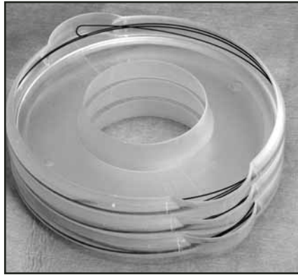
CATALOG NUMBER RM01 Guide Wire Basin

THE RINGMASTER™ GUIDE WIRE BASIN is a multi functional product designed to organize, hydrate and facilitate identification of wires and catheters on the sterile field. Packaged individually, 10 units per box.